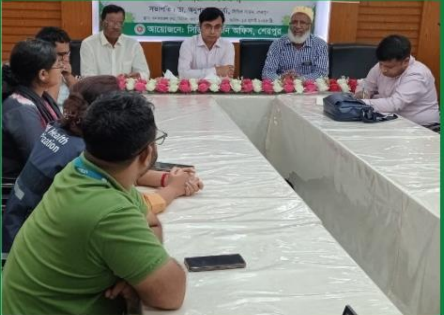
Briefing Meeting with Civil Surgeon, Upazila Health & Family Planning Officer and other EPI Stakeholders in Sherpur District