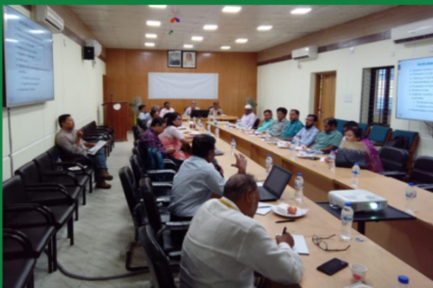
Briefing meeting with Civil Surgeon, UH&FPO and Other EPI stakeholders, Rangamati District

July 30, 2023 TRAction Conference Room, icddr,b