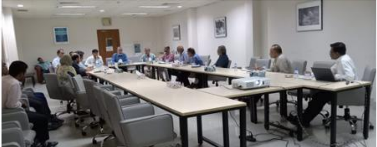
Briefing Meeting with Newly Joined Additional Secretary, Health Service Division, MoHFW

July 30, 2023 TRAction Conference Room, icddr,b